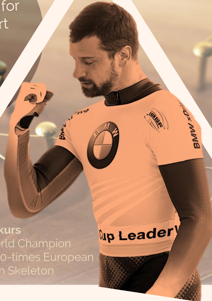
Martins Dukurs 5-times World Champion (FIBT) and 10-times European Champion in Skeleton

90% of financing for professional sport comes came from the private sector